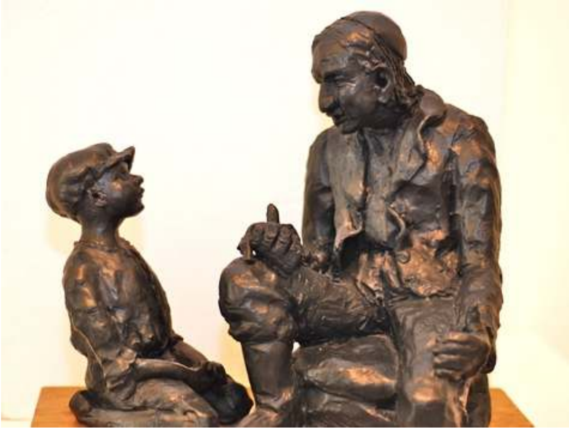
Oliver is taught the art of pick pocketing. Sculpted in terracotta clay and also available in bronze. 30 x 20 cm.