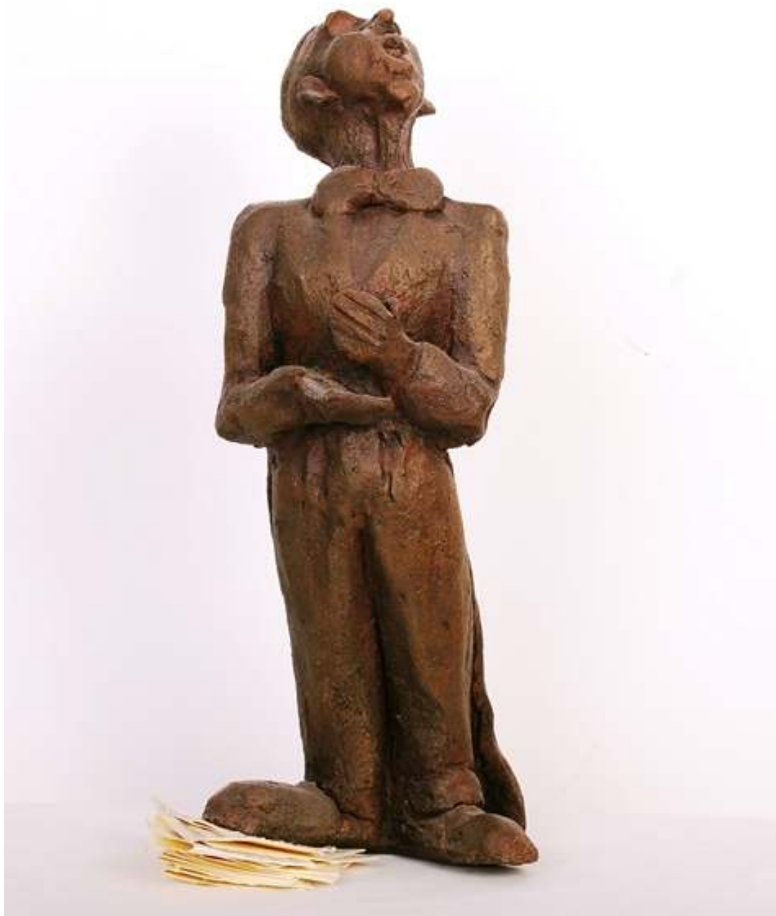
Elderly man singing in local operatic society. Terracotta 24 x 10 cm.