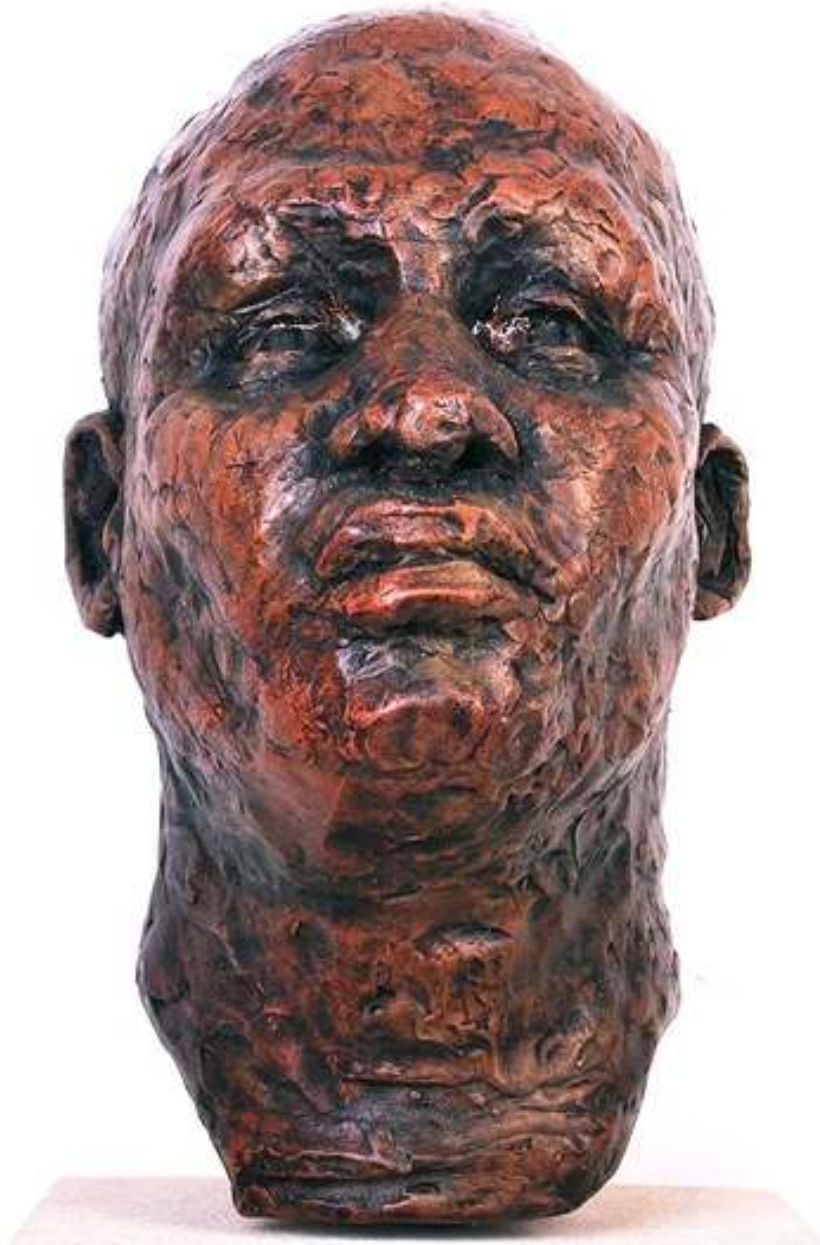
Head of an Afro-Caribbean man sculpted in terracotta clay and also available in bronze. 30 x 18 cm.