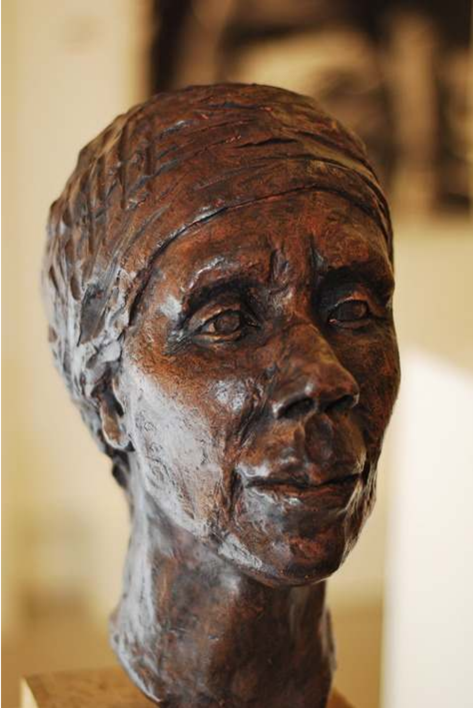
African woman proud of her culture. Sculpted in terracotta clay and also available in bronze. 30 x 18 cm.