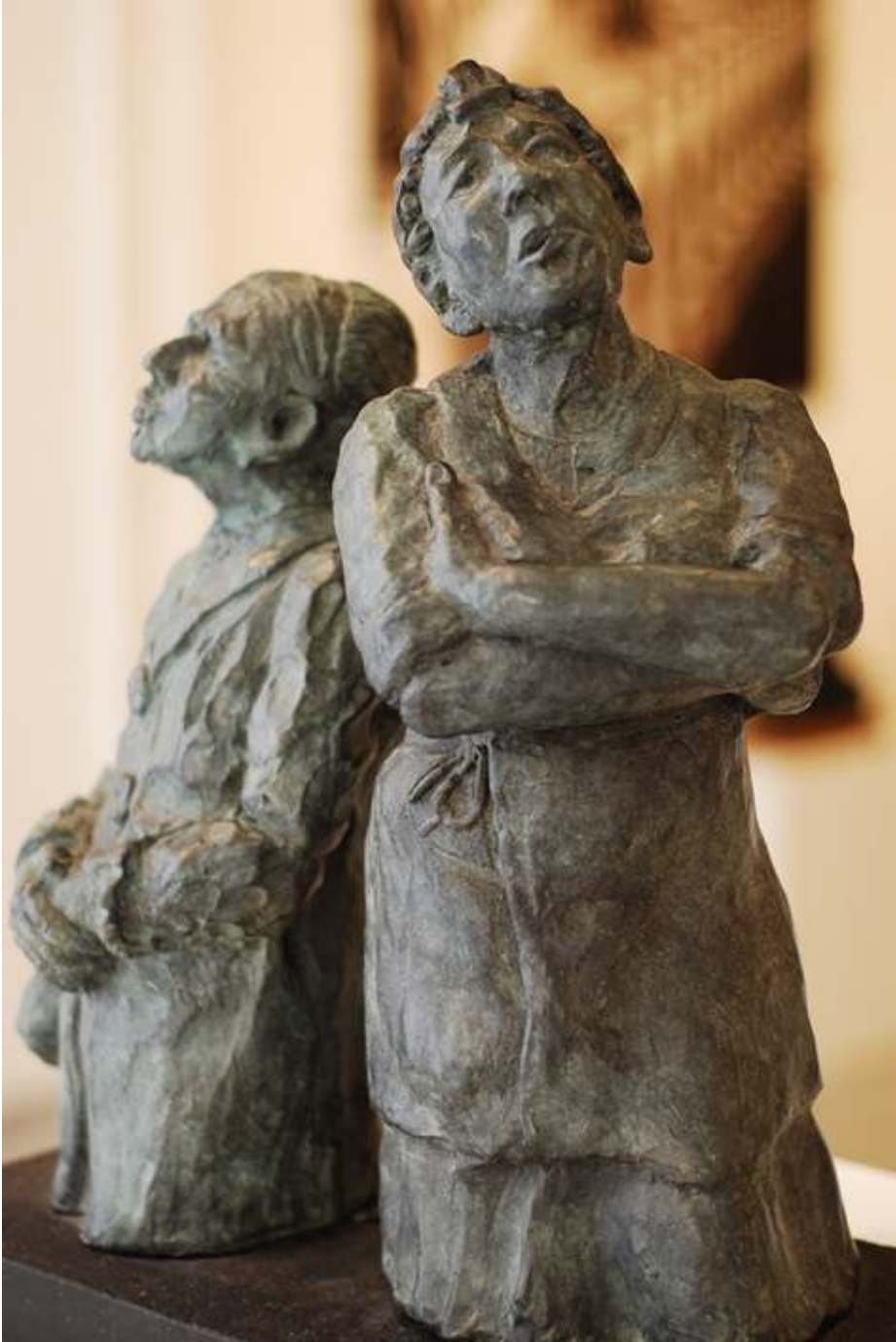
Two 1950's women – Hilda and Gladys - spread malicious gossip on their neighbours in a London suburb. Sculpted in terracotta clay and also available in bronze. Mounted on a marble base. 33 x 19 cm.