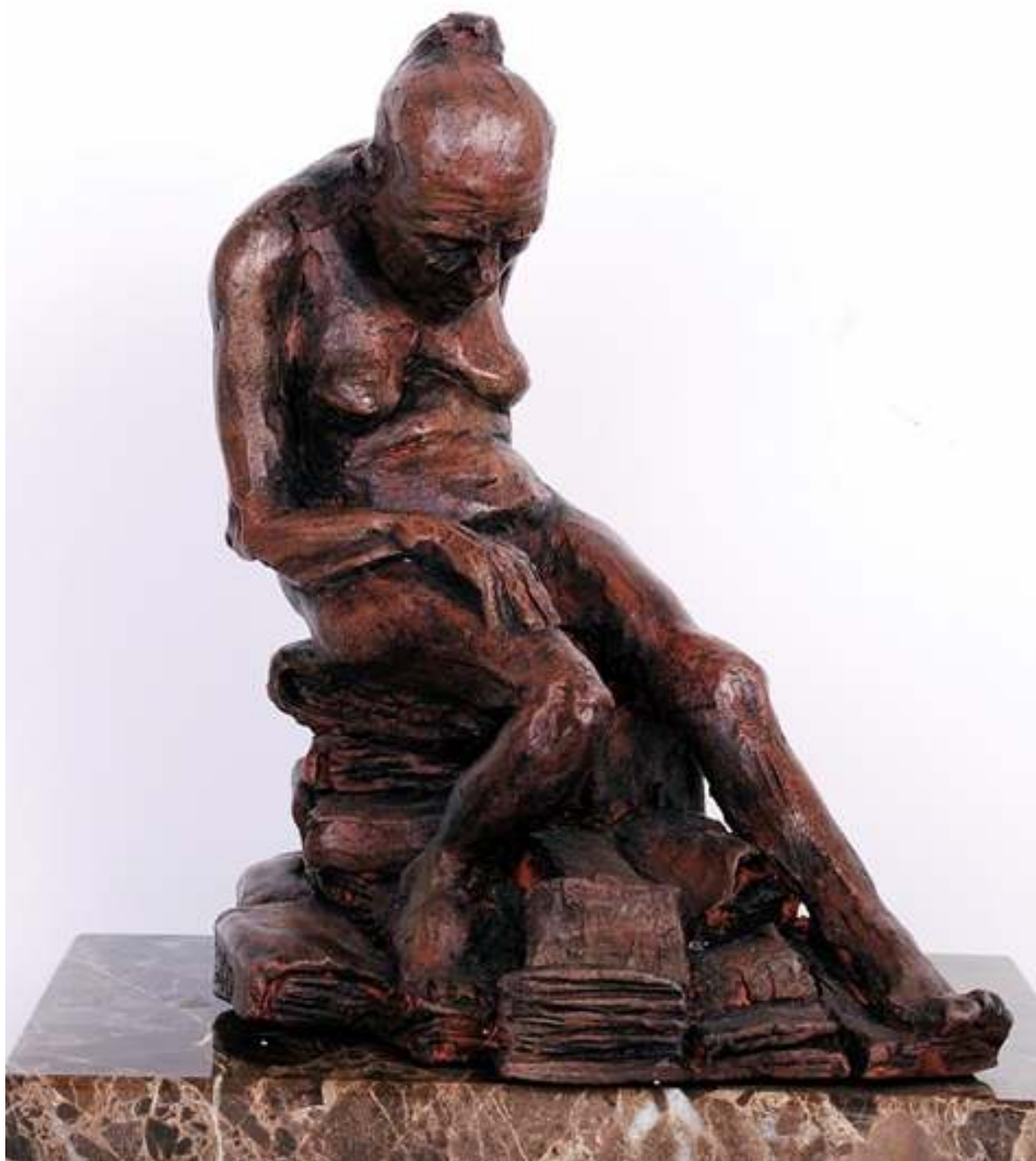
Every book tells a story. Terracotta 25 x 25 cm.